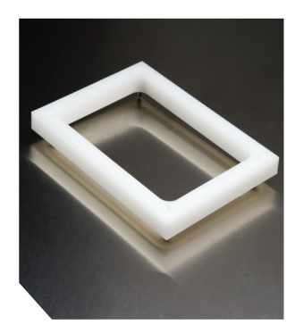
Half Inch Spacer VMFUV05SP*