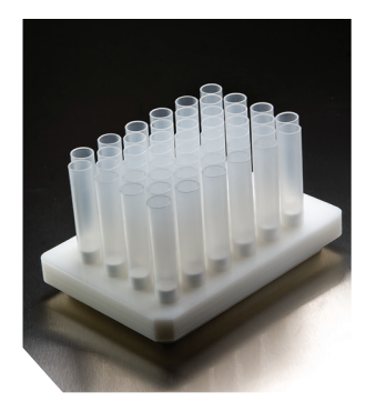
48 Well Extraction Plate VMF48EP