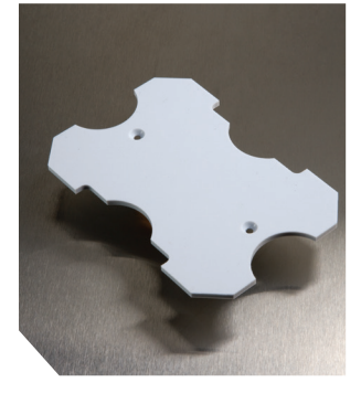
Collection Plate Riser VMFUVR1