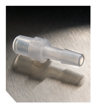
Barbed Hose Adaptor VMFUVST