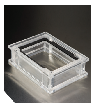
Manifold Top VMFUVMT