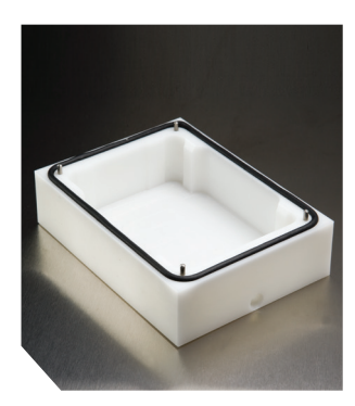
Manifold Base VMFUVMB