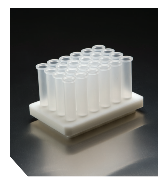
24 Well Extraction Plate VMF24EP