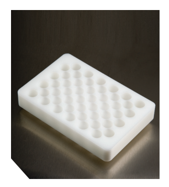
48 Well Collection Plate VMF48CP