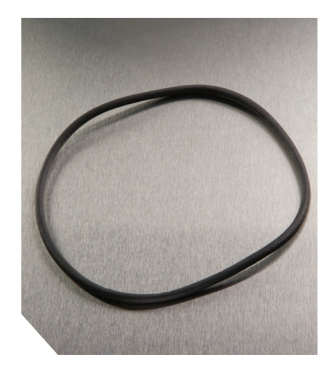
Base Gasket VMFUVEG