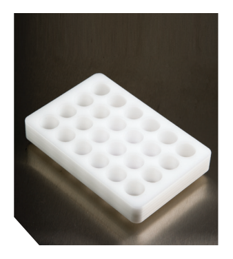
24 Well Collection Plate VMF24CP