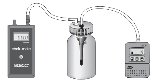
Figure 3. Calibration Train with Jar