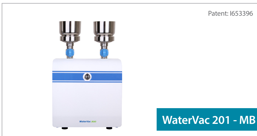
WaterVac 201 - MB