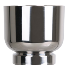
Rocker, 300 ml SF Stainless Steel Funnel (180100-03)