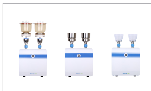
Compatible with various kinds of adaptor and filter holder