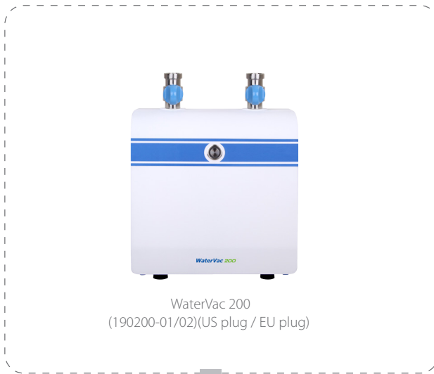
WaterVac 200 (190200-01/02)(US plug / EU plug)