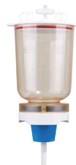
Rocker, 500 ml MF 5, Magnetic Filter Holder (200500-01)