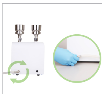
360° Rotational L - type hose barb