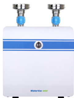
WaterVac 200 - MB (190220-01/02)(US plug / EU plug)