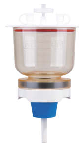
Rocker, 300 ml MF 3, Magnetic Filter Holder (200300-01)