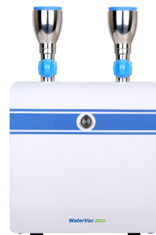
WaterVac 200 - MS (190210-01/02)(US plug / EU plug)