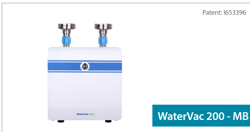
WaterVac 200 - MB