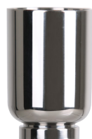
Rocker, 500 ml SF Stainless Steel Funnel (180100-05)