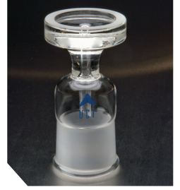
47mm Support Base