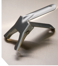
47mm Aluminum Clamp