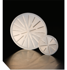
47mm/90mm KEL-F Screen