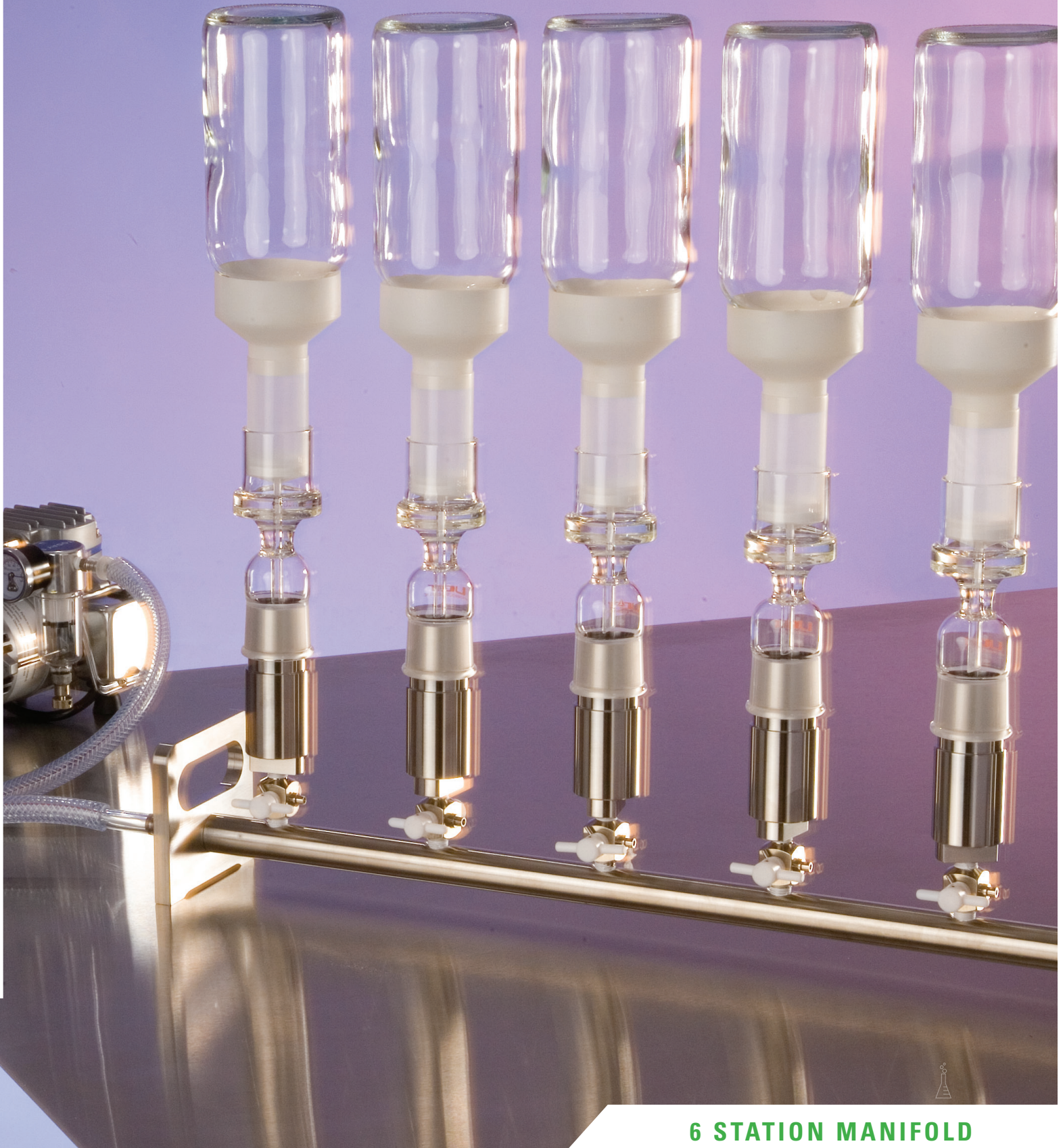
6 STATION MANIFOLD