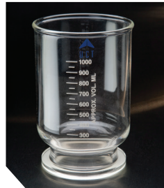
90mm 1000ml Funnel