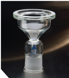
90mm Support Base