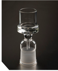
Glass Cartridge Adapter