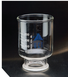
47mm 300ml Funnel