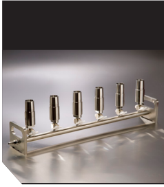
6 Station Manifold