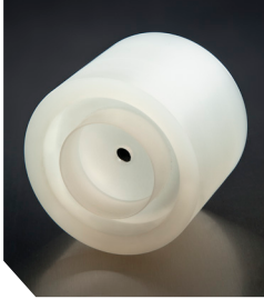
Universal Cartridge Adapter