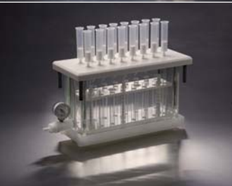
Vacuum Manifold System 16 Position System Part Number: VMF016GL