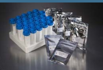
QuEChERS Multi-Packs Part Number: ECMSSA50CT

PSA/C 18 dual layer SPE cartridge: 500 mg of PSA and 500 mg of endcapped C 18 in a 6 mL cartridge for high lipid clean-up (UCT: ECPSAC1856)